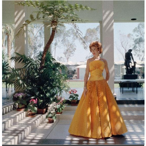
A legendary hostess who entertained in couture and Harry Winston jewels, Mrs. Bloomingdale embodied the intelligence and verve of a new generation of American women.

Few society figures remain as iconic as Betsy Bloomingdale. A true emblem of glamor and style, she epitomized the confidence of a post war United States: a moment in history in which the sun-soaked terraces and candle-lit tables of Southern California captured the world's imagination. Forever draped in haute couture, jewels, and an irresistible smile, Betsy Bloomingdale was a woman defined by exuberant, joyful elegance.